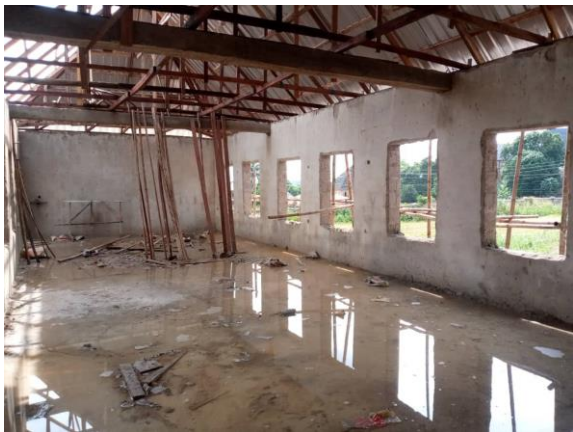
The internal plastering on the first floor is at advanced stage.