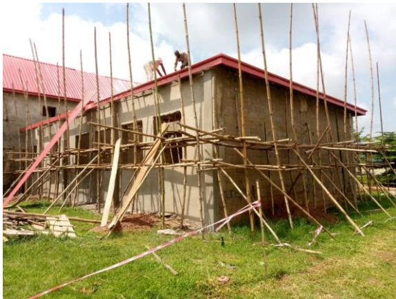
External work progress