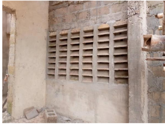
Entrance Foyer Screen wall