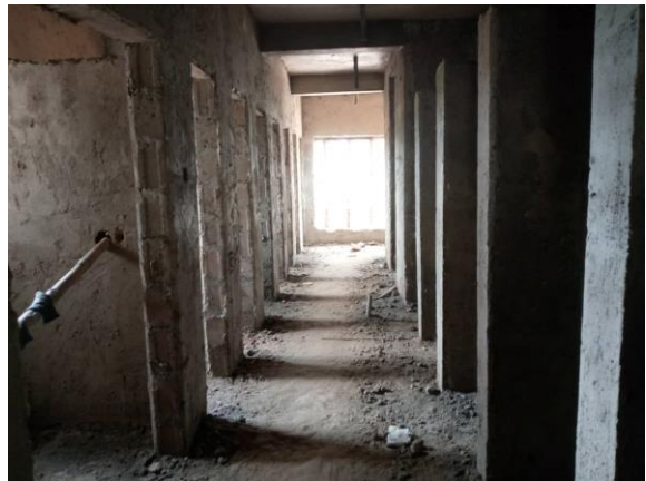
Work progress – ground floor toilets