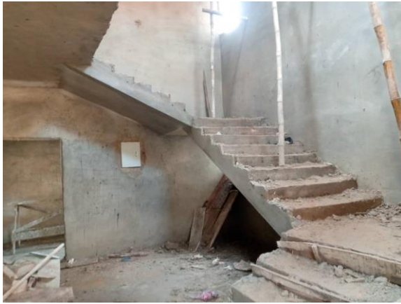
The internal plastering on the ground floor is at advanced stage.