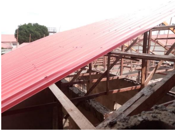
Ongoing roofing of Common Room